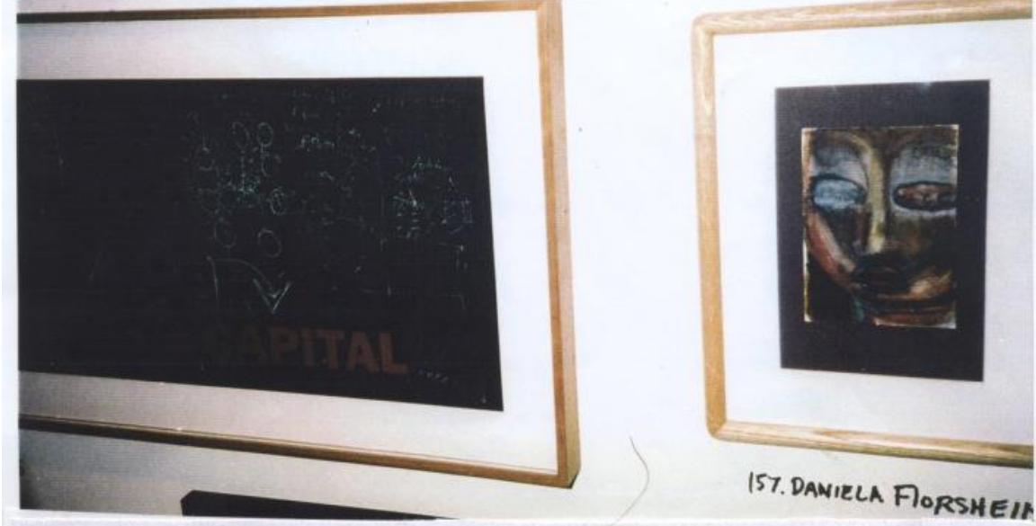
Joseph BEUYS 156 Creativity-Capital, silkscreen & lithograph $75

Ausstellung bei Feldman Gallery n. y. 1985